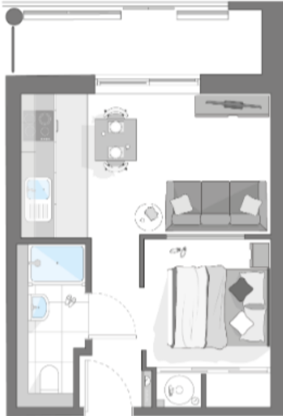
The Winwood – Type 1 & 2

Our studios make the space work really hard to provide a home at a really affordable price point.